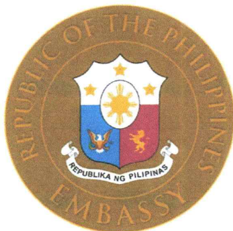
Figure 1. Philippine Embassy – Coat of Arms Design (Outdoor)